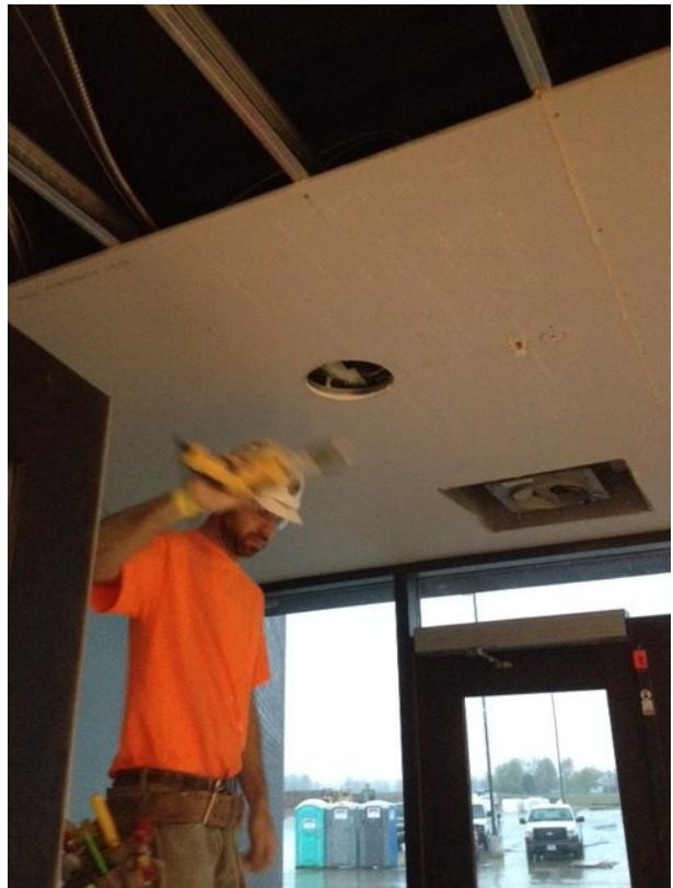
Installing entry drywall