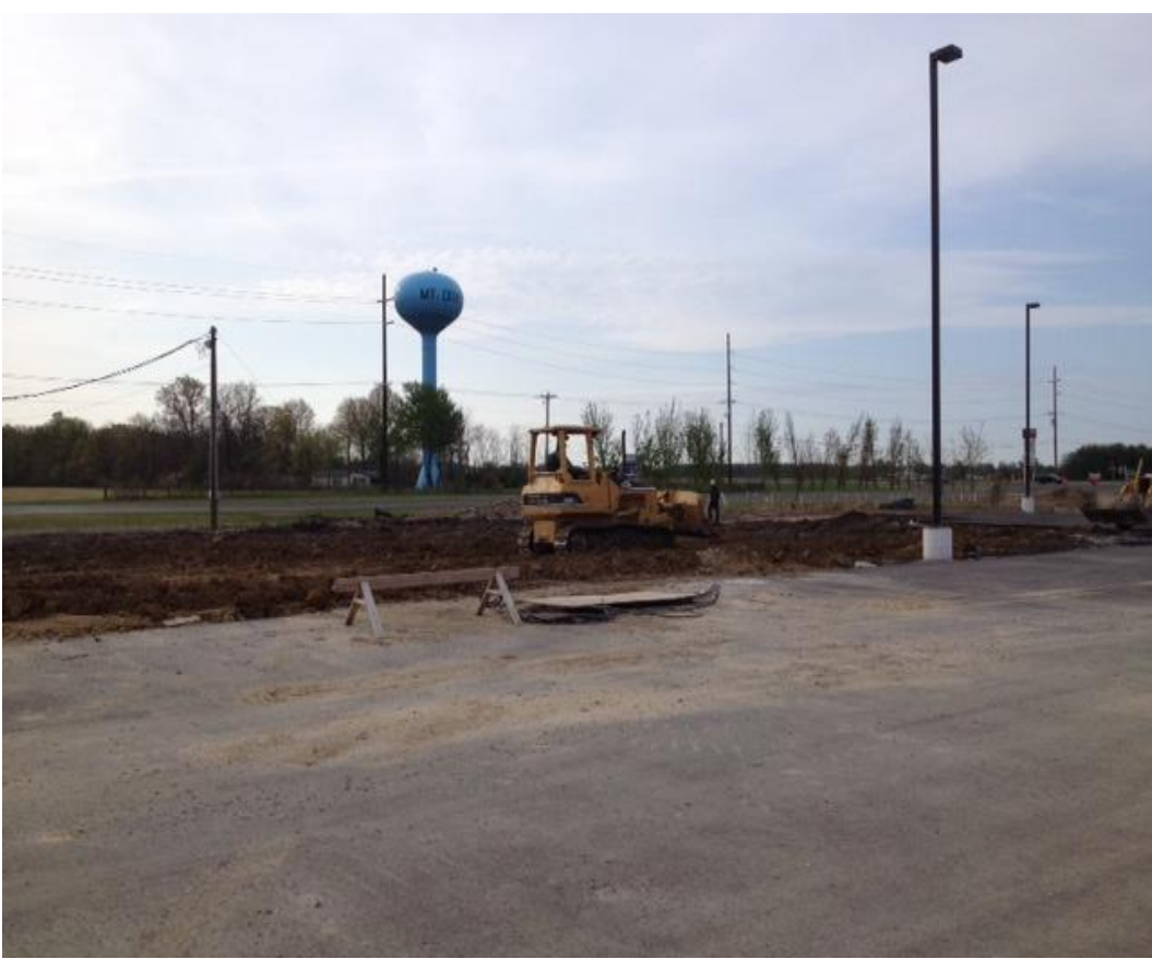
Grading and spreading topsoil