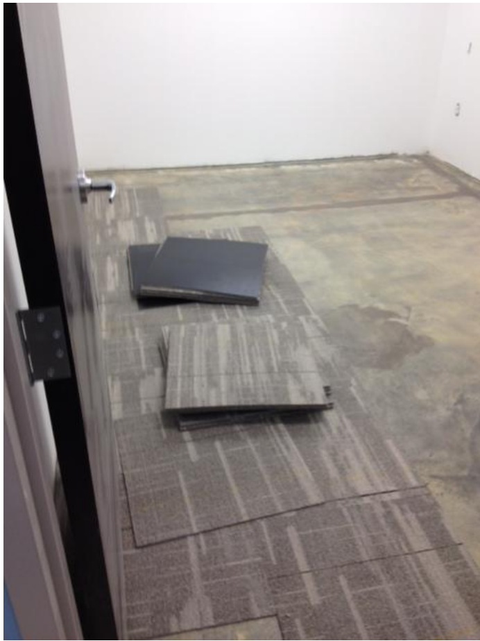
Laying the office area carpet