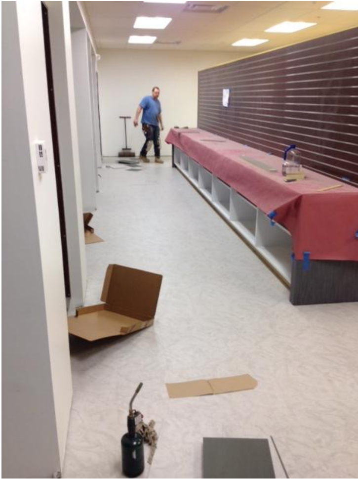
Installing book store flooring