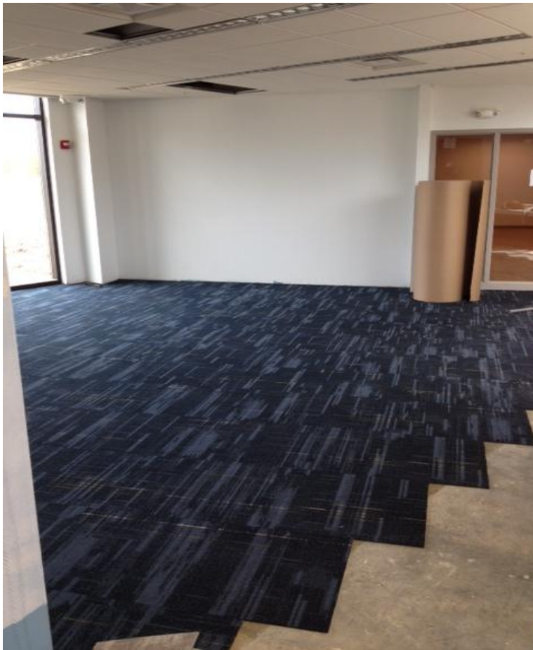
Library floors installed