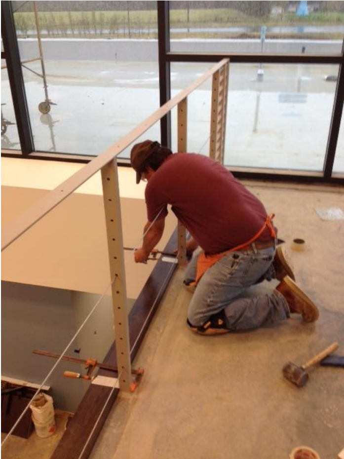
Installing trim at balcony rails