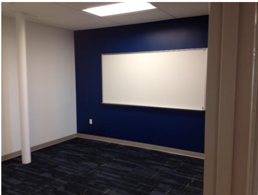
Study rooms completed