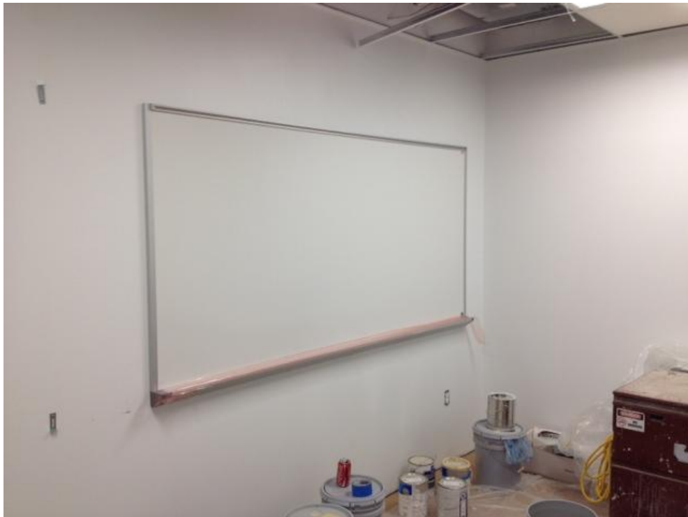
Marker boards installed