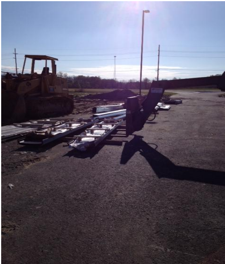
Unloading the new maintenance building