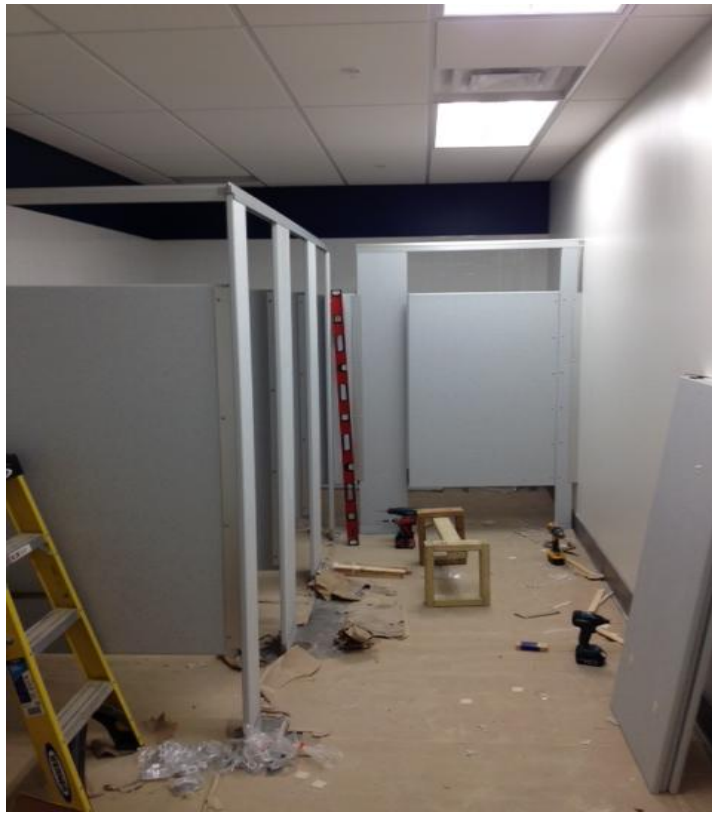
2 nd floor ladies restroom partitions installed