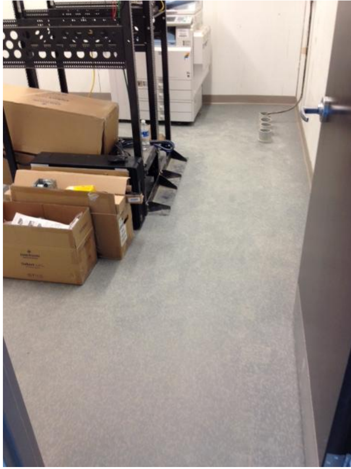
Technology room floors installed