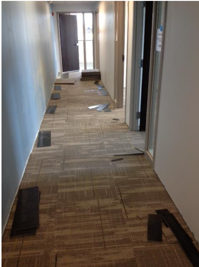
Office area floors completed