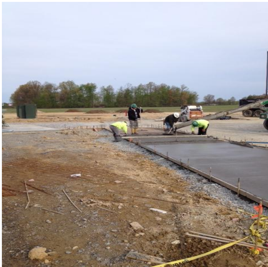
Continuing sidewalk pours