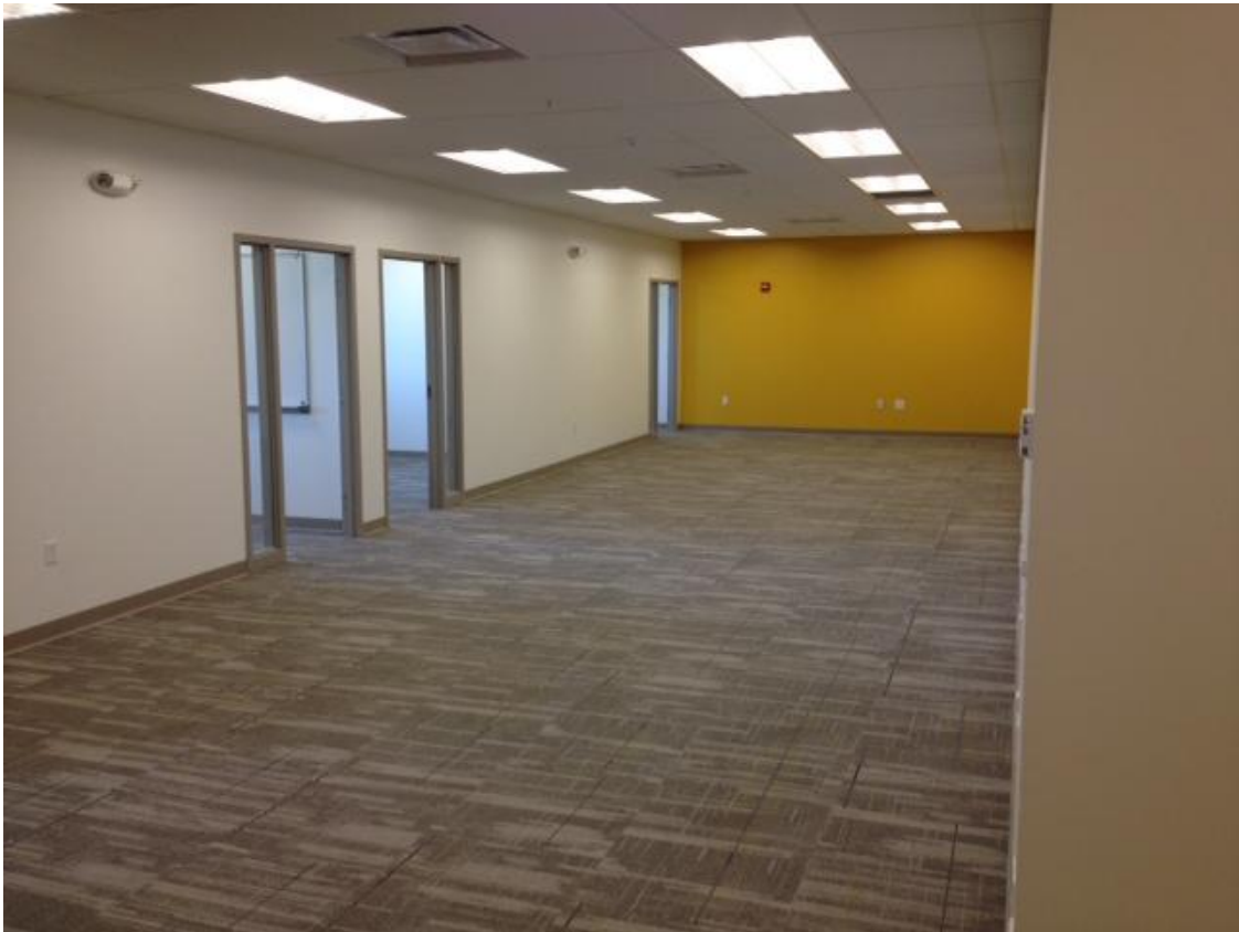
2 nd floor staff offices