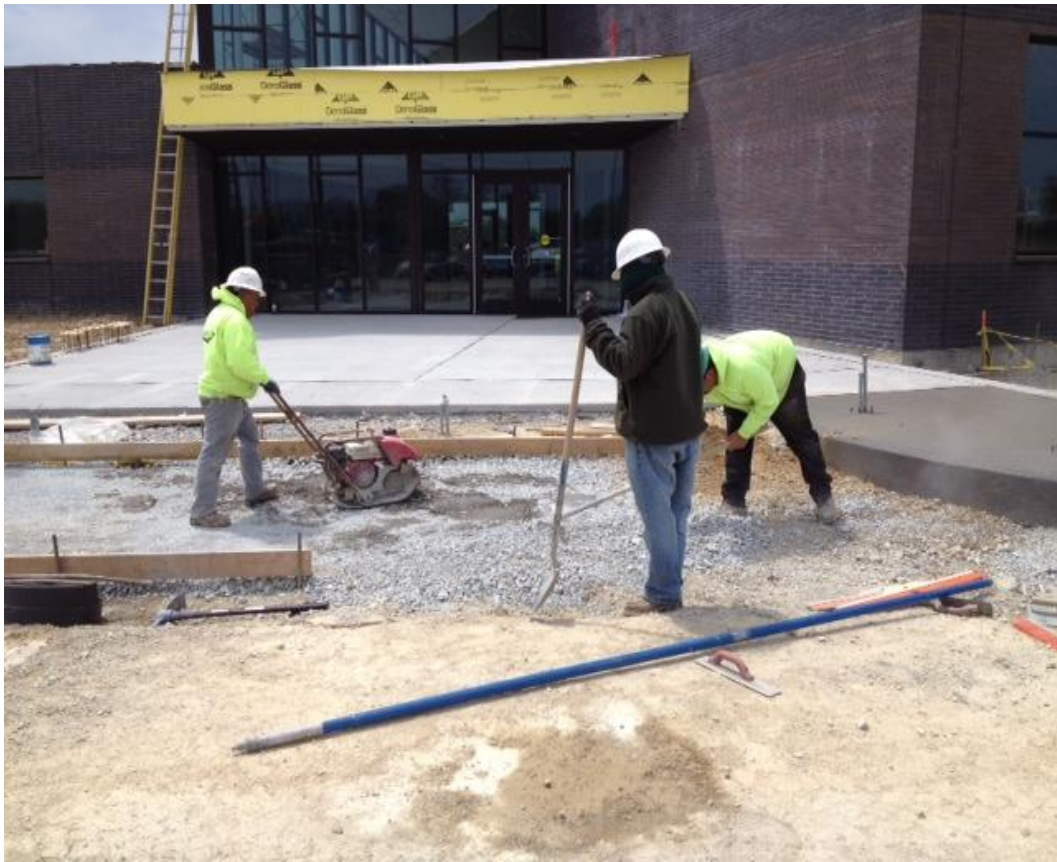
Prepping the drop off area concrete