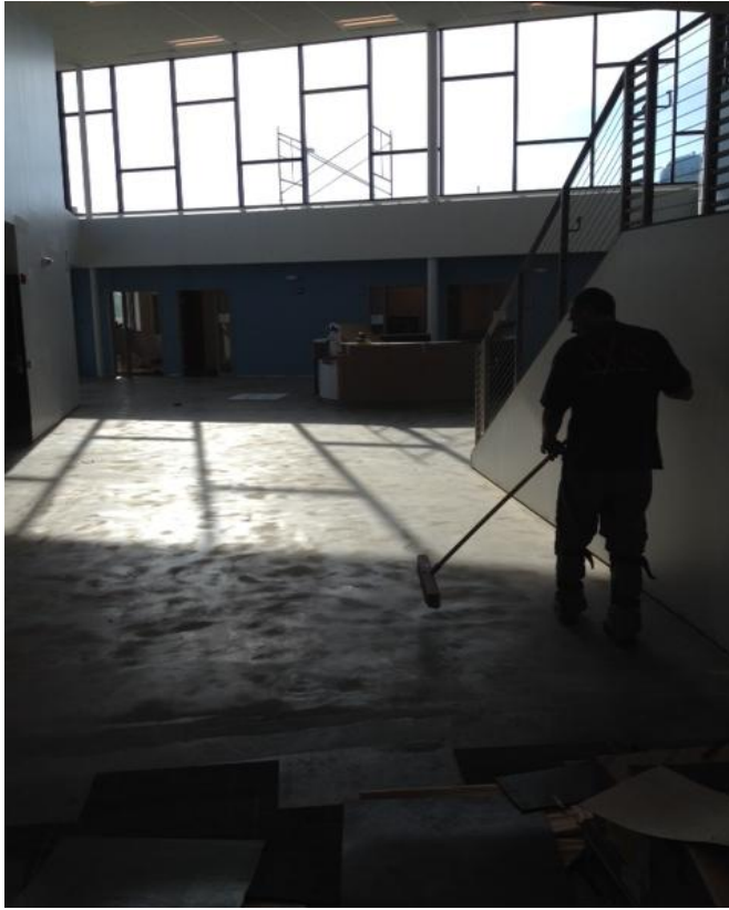
Prepping lobby floors