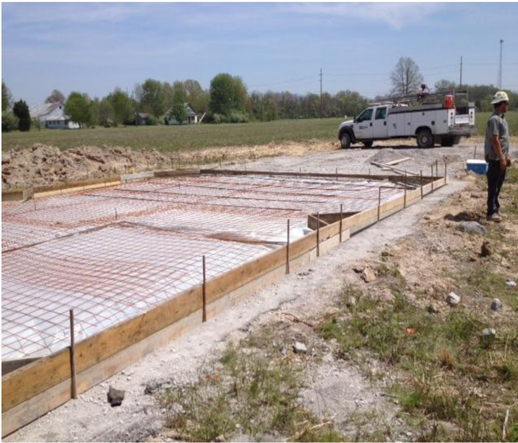
Forming the slab for the maintenance building