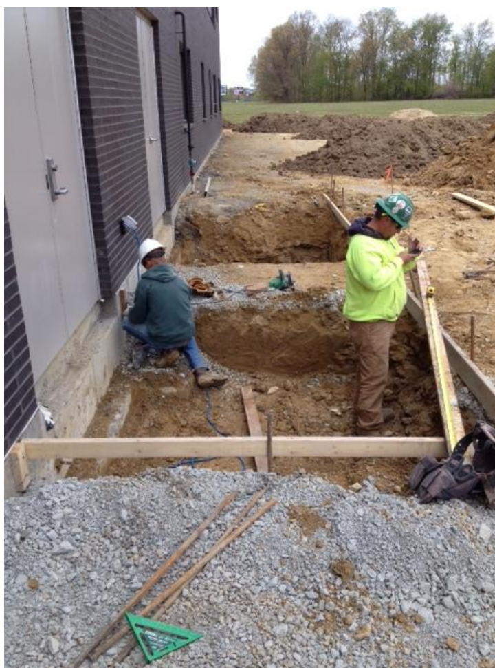
Prepping for frost slabs at exit doors