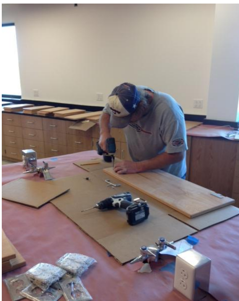
Replacing science lab doors