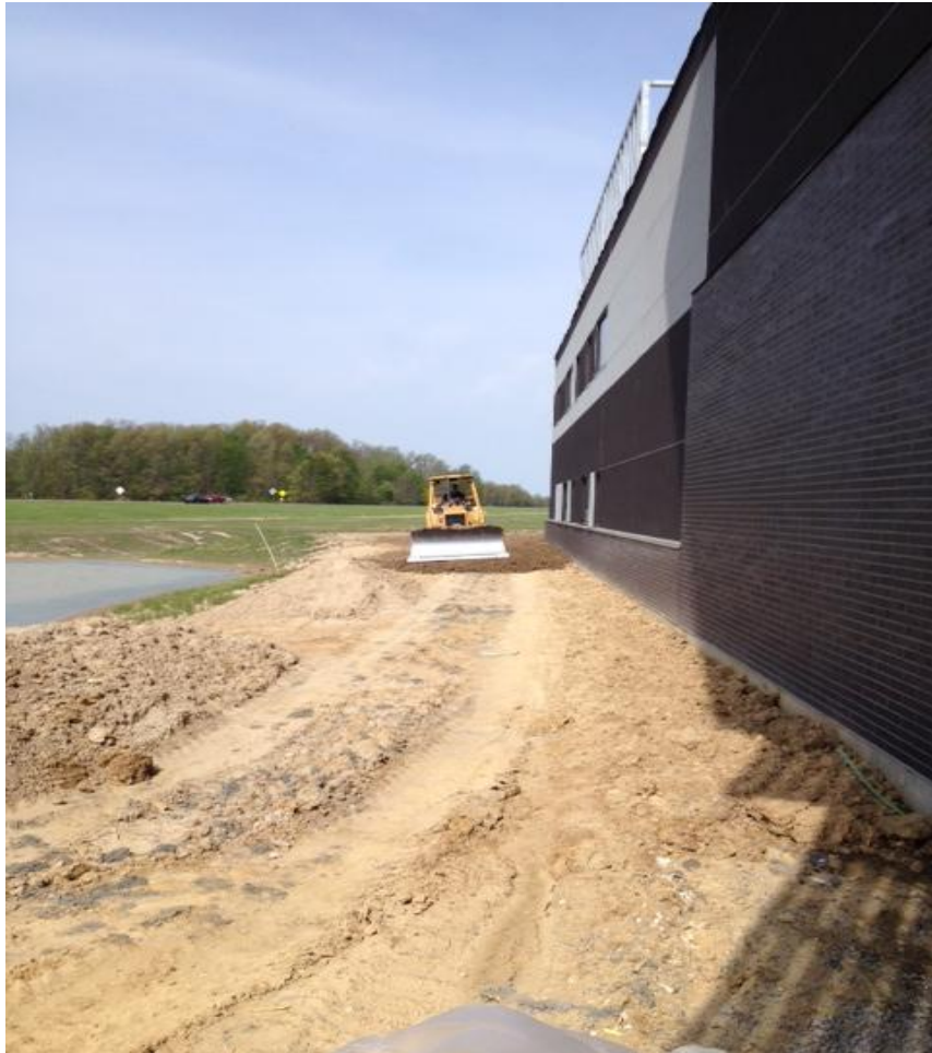
Installing topsoil around pond area