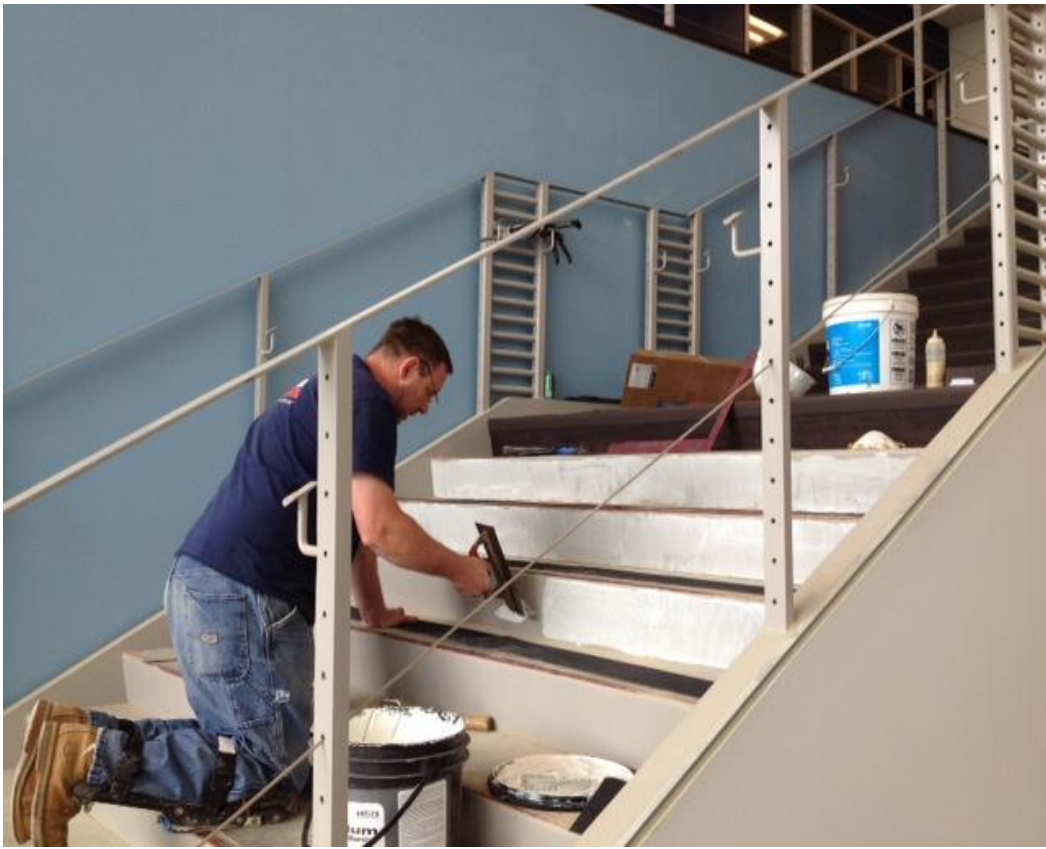
Installing stair vinyl