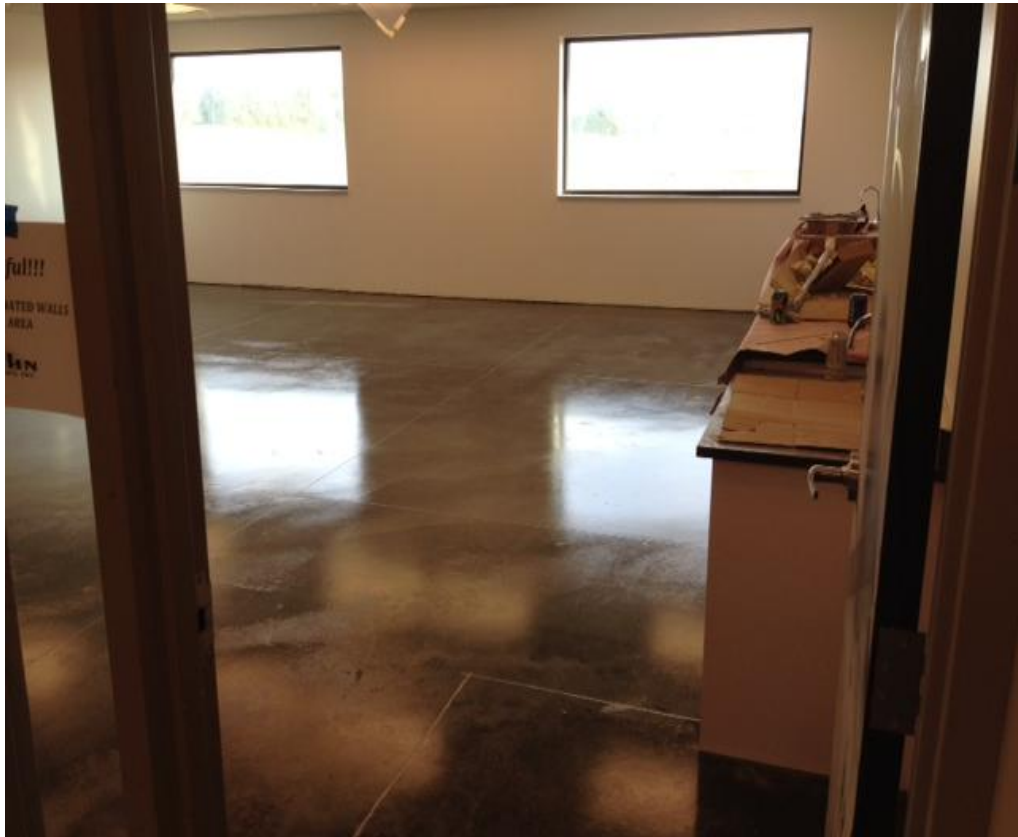
Flex lab floors sealed