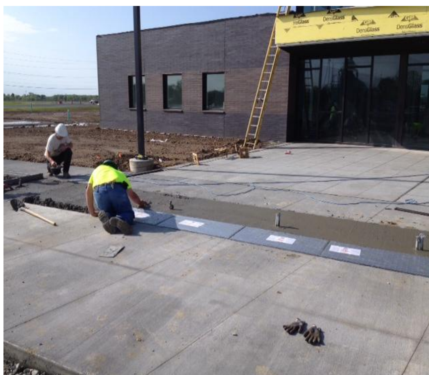
Installing the ADA mats at drop off area