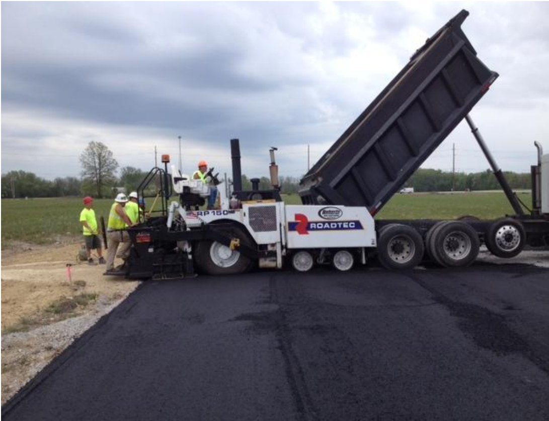
Paving the maintenance road