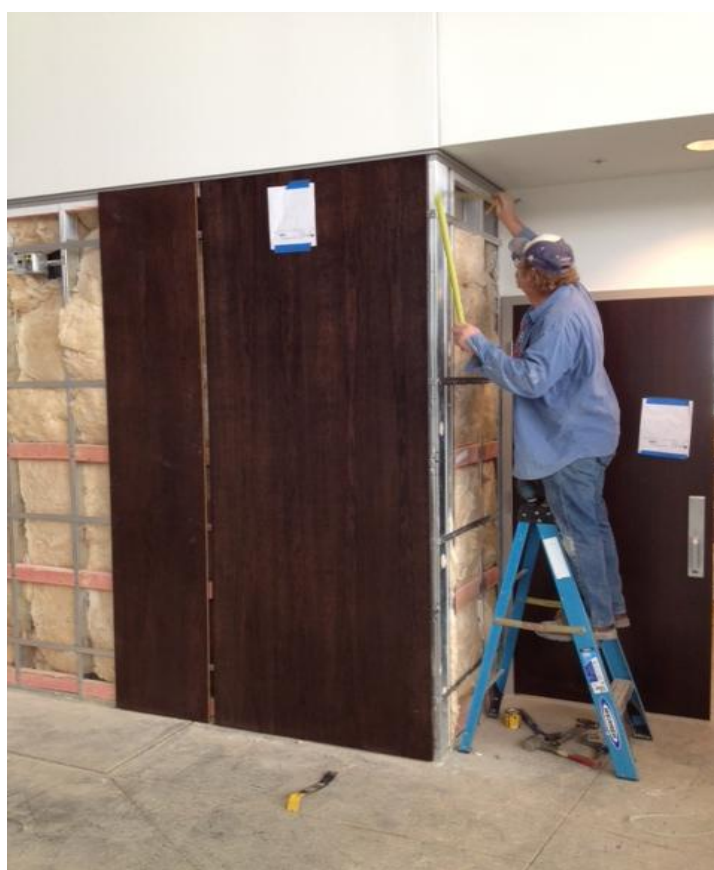
Installing cherry wall panels