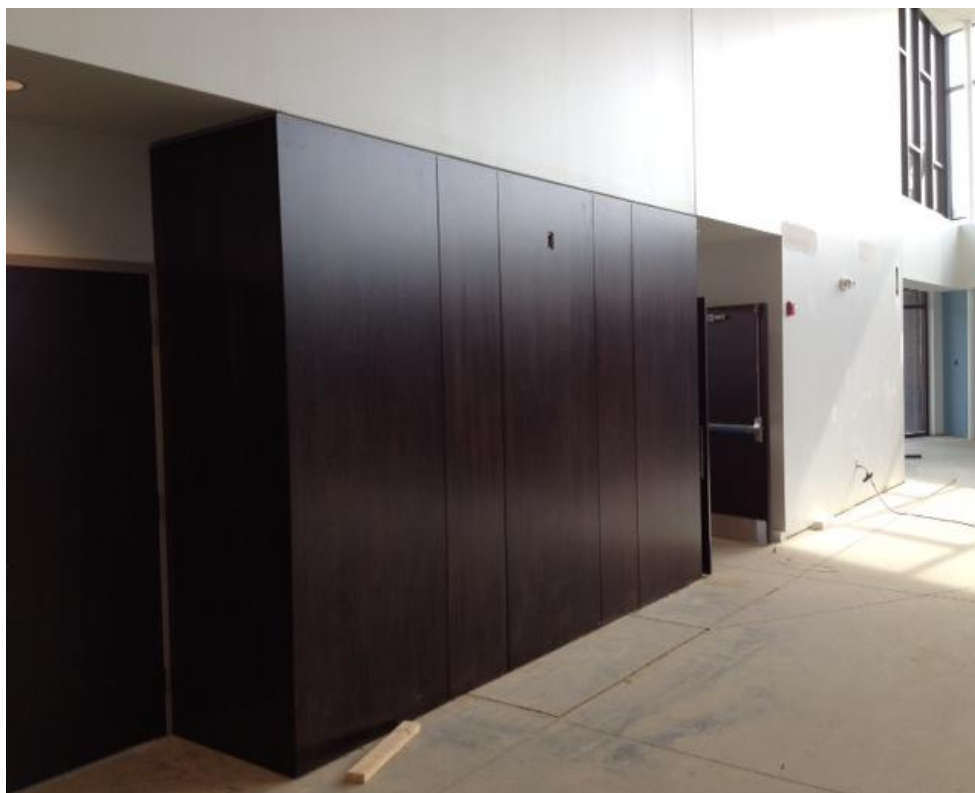
Cherry wall panels installed