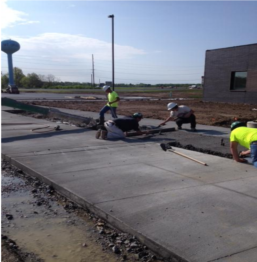
Pouring the last piece of sidewalk