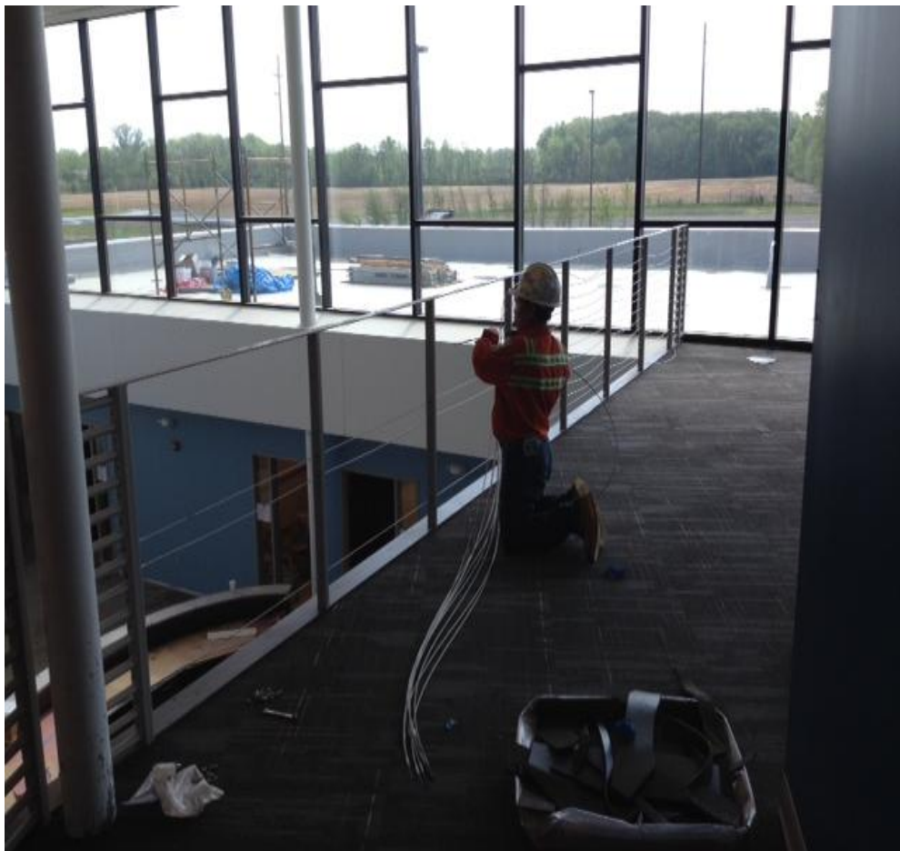
Installing balcony cable rails