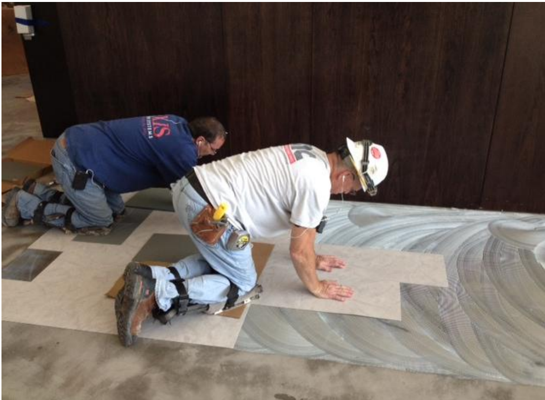
Installing lobby tile