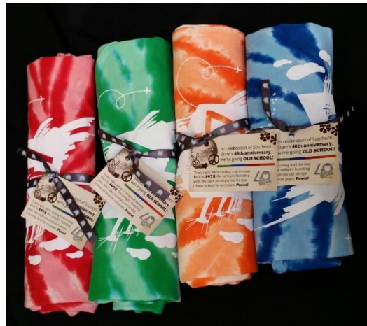
1970's themed shirts with 40 th Anniversary tag used to incentivize event registrations.

In an effort to help boost enrollment for fall semester, the college held Steps to Success May 4-7 at each campus for all students. The event, designed to promote early registration, was a celebration of our 40 th anniversary -- old school style! Rocking it all the way back to 1975, students enjoyed a tie-dye tribute to forty far-out years. As an incentive to attend and get registered for fall semester, students received a one-of-a-kind shirt, cake, and were able to participate in a variety of 40 th anniversary activities for additional prizes. At the conclusion of the week, nearly 200 students attended and registered for fall classes!