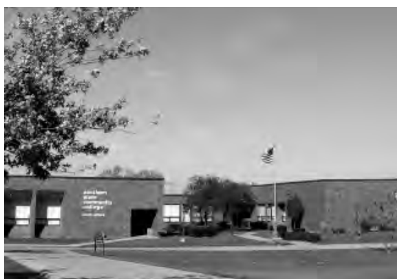
Southern State Community College 2012-2013