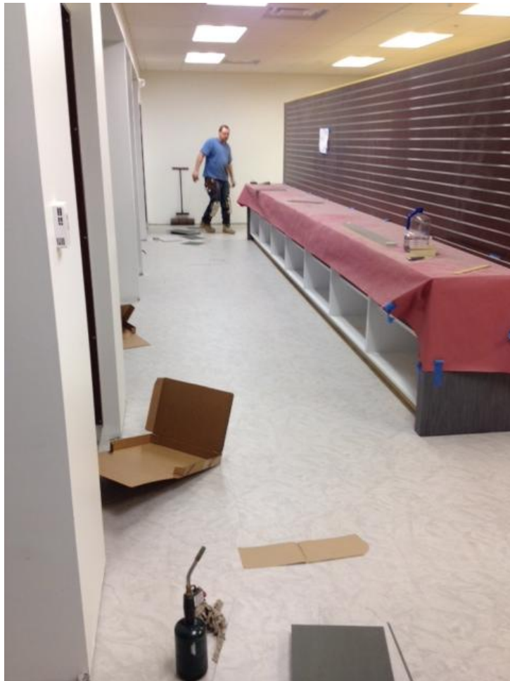
Installing book store flooring